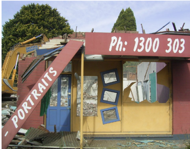
Demolition of the buildings from the converted Coach & Horses Hotel on 4th May, 2005