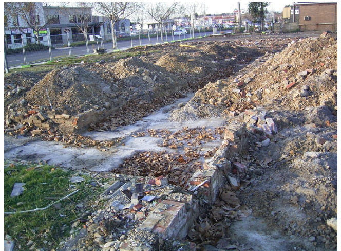
The site undergoing investigation in June, 2005. Unfortunately time was not on the archaeologists side, with a job that often takes years to complete.

Anita showed a very interesting number of photos and handed around many of the pieces. A wonderful gesture on her part, as these items are still under control of Heritage Victoria, and have a high heritage value, not only to Ringwood, but to Victoria.